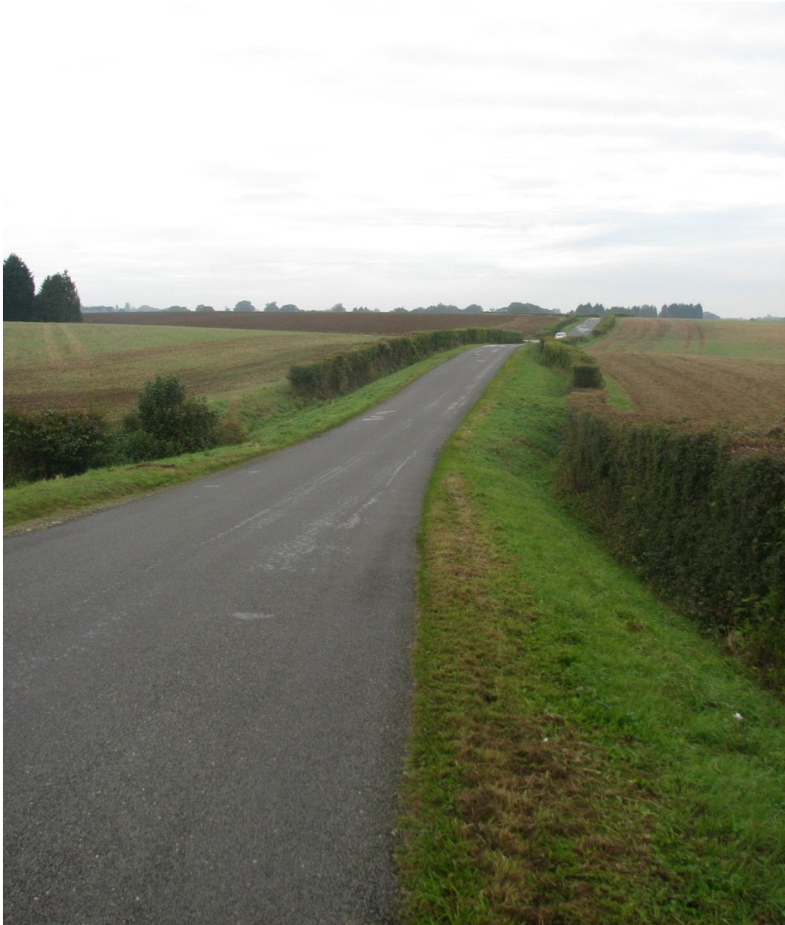
Figure 3 - Verges on undulating lane at Shalford Road (BTE Lane 24)