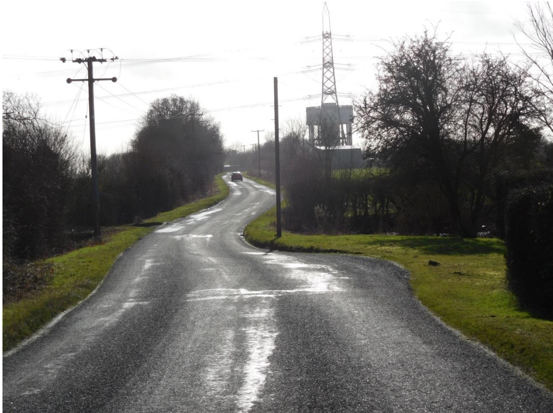
Figure 10 - Modern intrusion on aesthetic view of Lanham Green Road (CRESSLANE7)