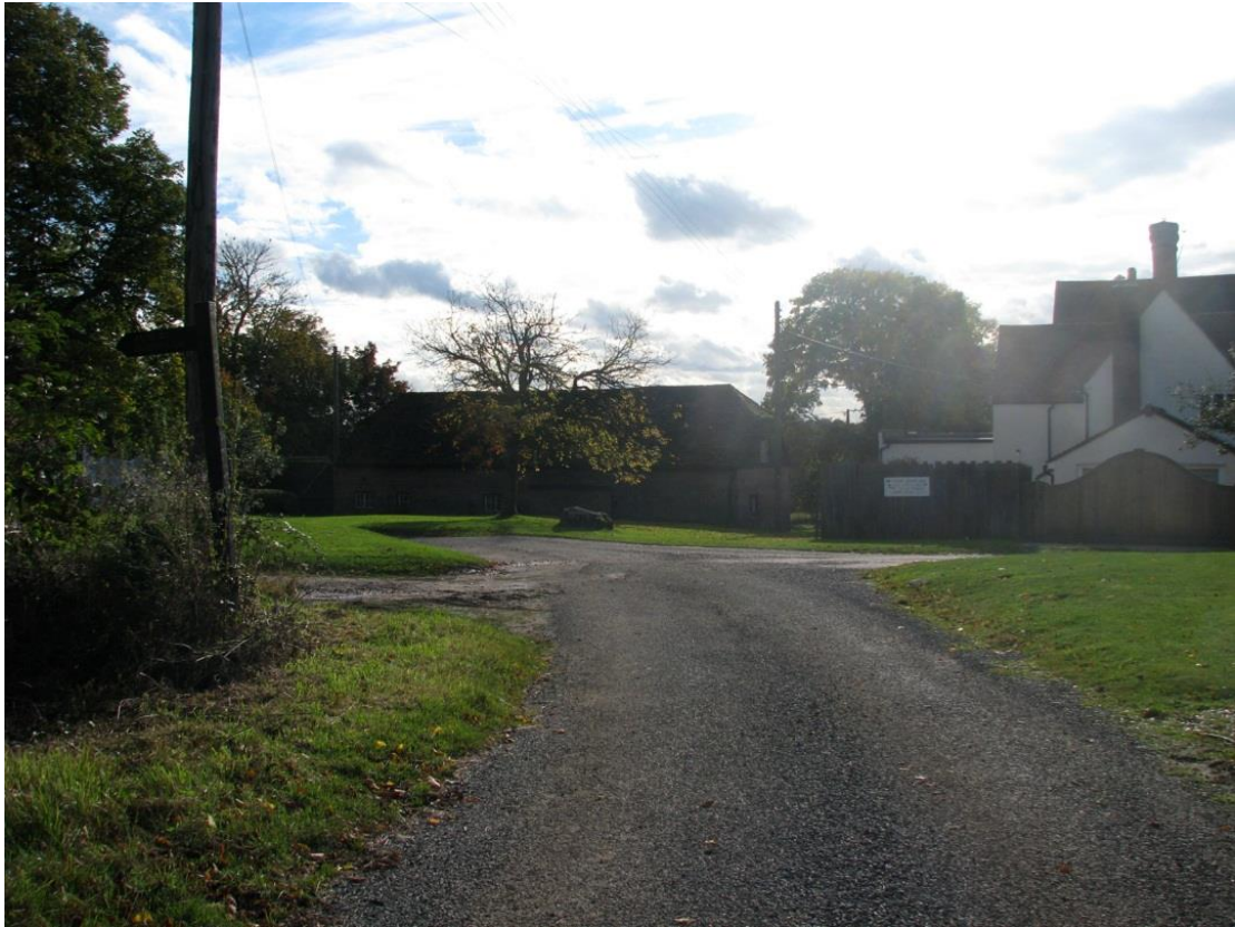
Figure 8 - Greens at Codhams Lane forming part of the important historic settlement associated to this short length of lane (BTE Lane 28)