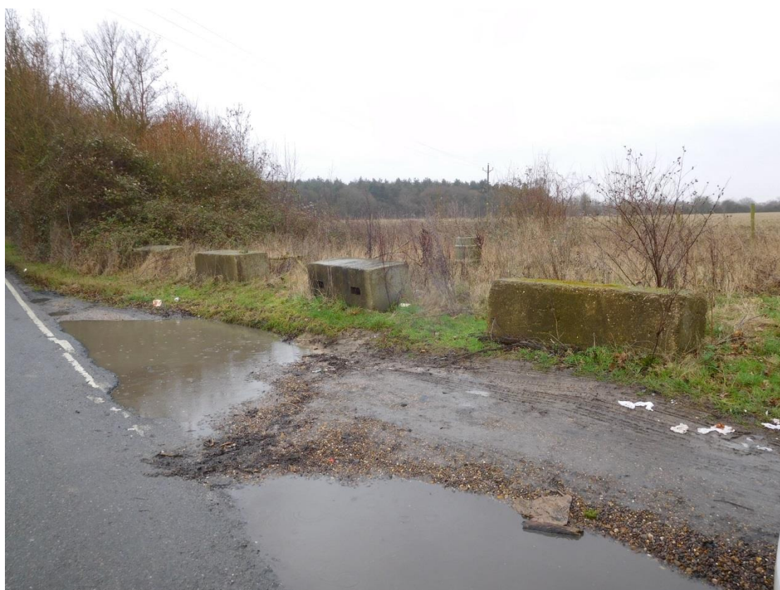
Figure 6 - Shows area of erosion in an area used for parking, with concrete blocks at field entrance (CRESSLANE5)

Description of erosion damage – this was a description of erosion damage to the structure of the lane from vehicular traffic along the length of the unit of assessment. The description included information on damage to banks, verges and surfaces.