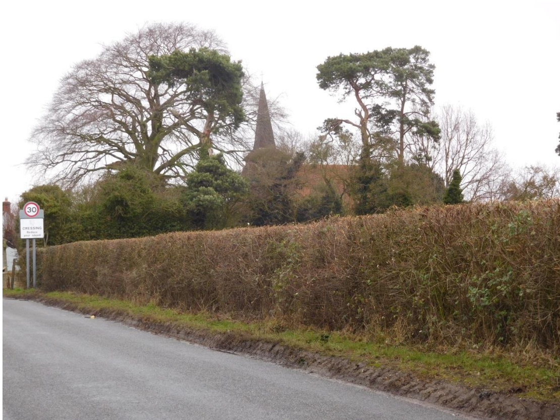
Figure 9 – Church Road with view of Cressing Church (CRESSLANE8)

Views – notable views, which are particularly scenic, unusual or which include contemporary historic features of note e.g. a parish church, listed building, farm complex or landscape that are framed by the lane and/or its associated vegetation were identified.