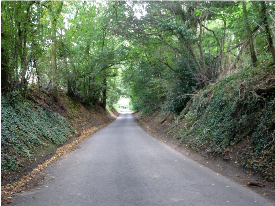
Figure 4 - Sunken lane at Hulls Lane (BTE Lane 35)