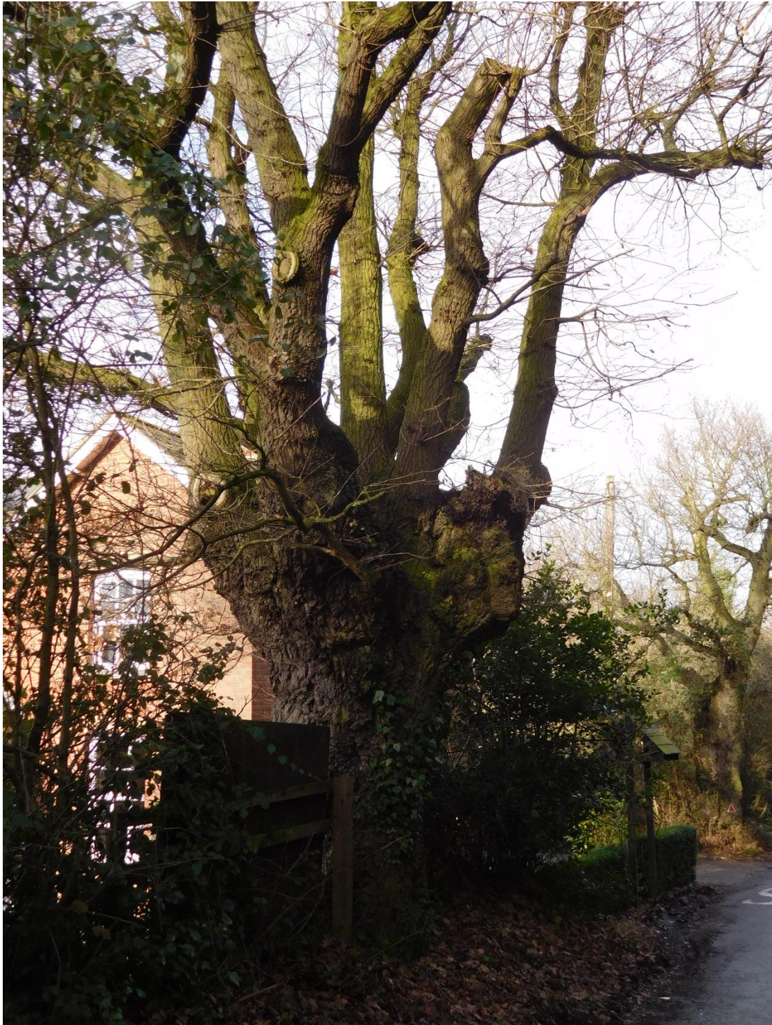
Figure 5 - Veteran pollard (CRESSLANE2)