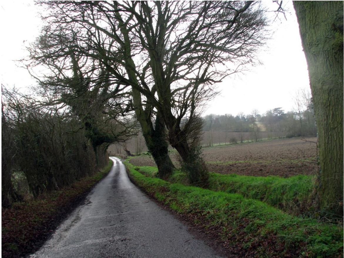
Figure 2 - Change in form of lane with drop into the valley (BTE Lane 125)