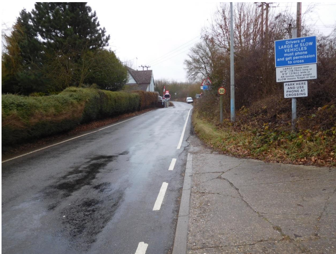
Figure 7 – Station Road showing improvements of kerb stones and road signs (CRESSLANE5)