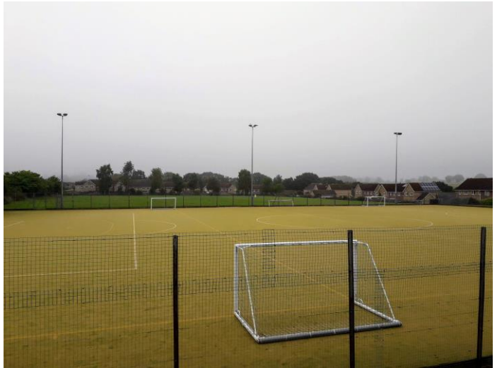
The existing artificial football pitch at Halstead

Following a successful budget bid and securing funding from the Football Foundation, tenders have been sought to replace the artificial training pitch at Halstead. We expect the pitch to be installed later in the year.