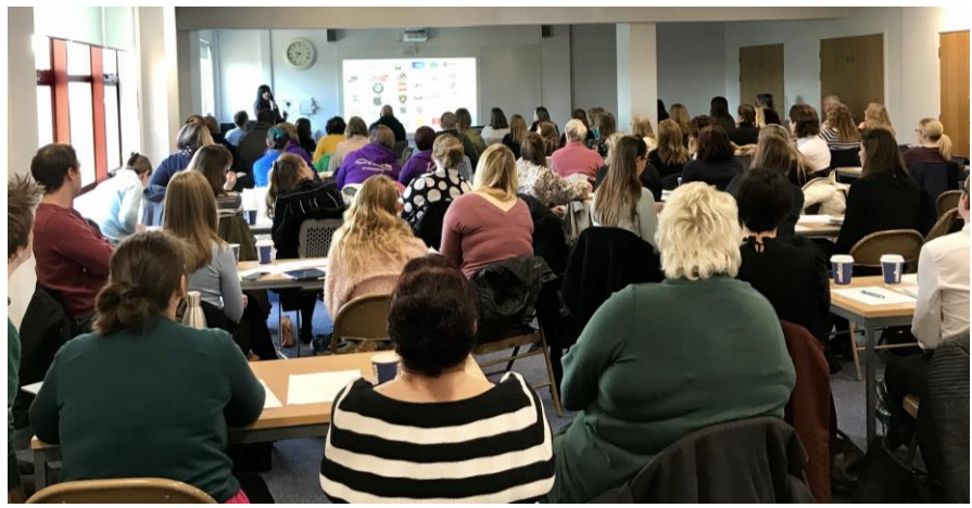
Attendees at Facebook Digital Skills workshop

On 19<sup>th</sup> November 2019 we were extremely pleased to partner with BuzzStart Academy, supported by the Digital Skills Partnership at the South East LEP, to deliver a Facebook Digital Skills workshop. 77 people attended the free event, including 35 Braintree District businesses, to learn about Innovation and Social Media Marketing. It was so successful that we were approached to host a Google Digital Garage event which will happen tomorrow (Tuesday 17<sup>th</sup> December 2019) and we expect numbers to be around the same. Both events are hosted at Colchester Institute's STEM Innovation Campus whose excellent facilities enabled us to showcase the breadth of learning opportunities also available in Braintree.