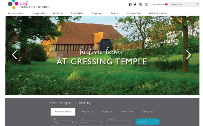
Logo Application to website

Delivery of the tourism website is on schedule as per the project timeline issued by the developers to us. Officers have been receiving training on the relevant systems to ensure we are able to update the content and information on a regular basis. We look forward to launching the website in January 2020.