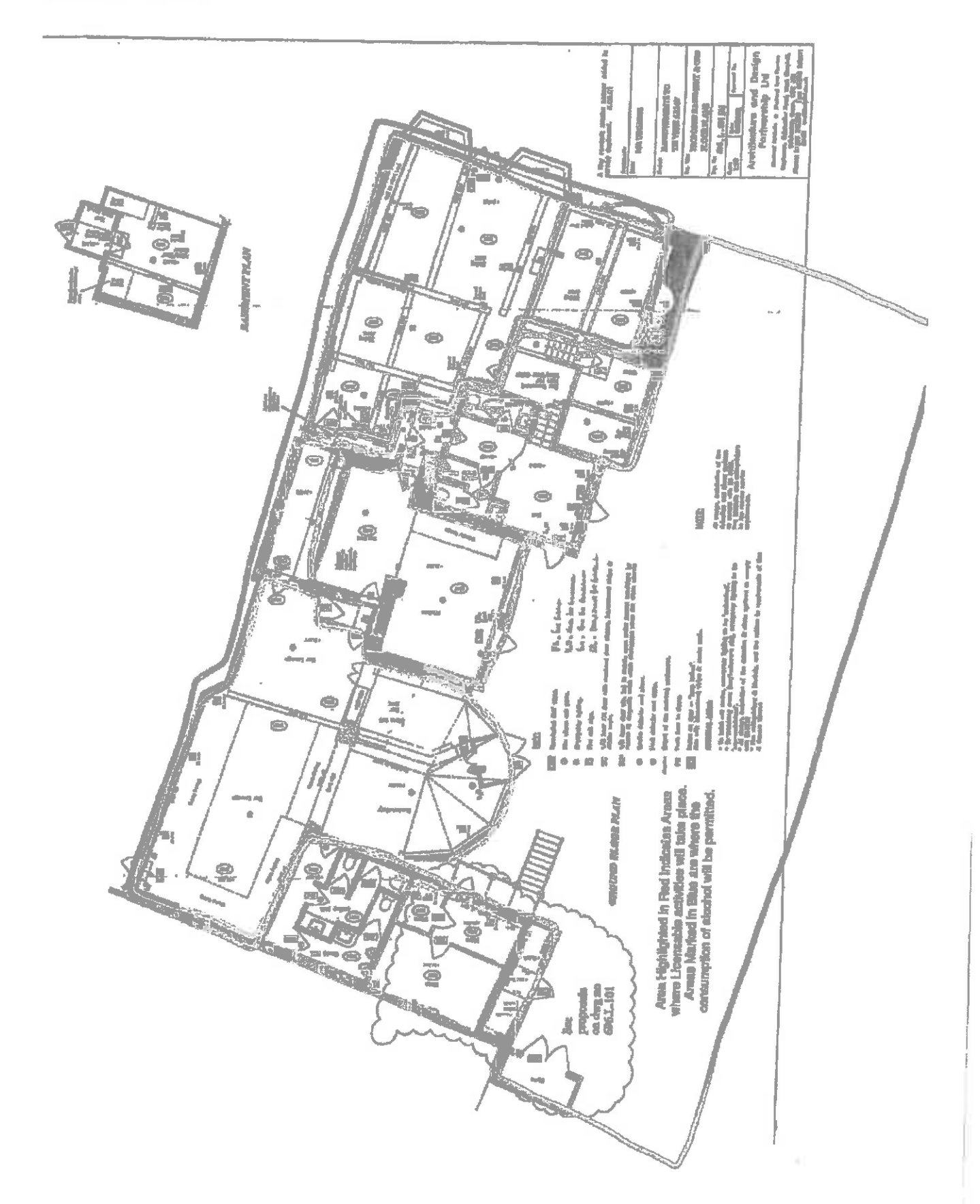
Annex 4 - Plans