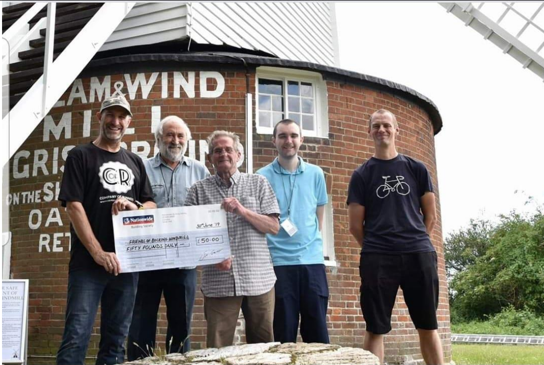
Friends of Bocking Windmill receiving a cheque from Company of runners