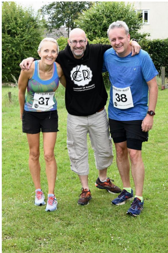
Company of Runners windmill stop on the Revelry Riot Self Navigation race June 2019