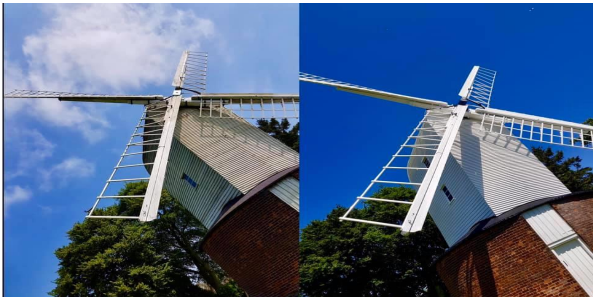
Before and after Decoration works Spring 2019

In late June 2019 the external redecoration works of the mill were completed by local Millwright Bill Griffiths.