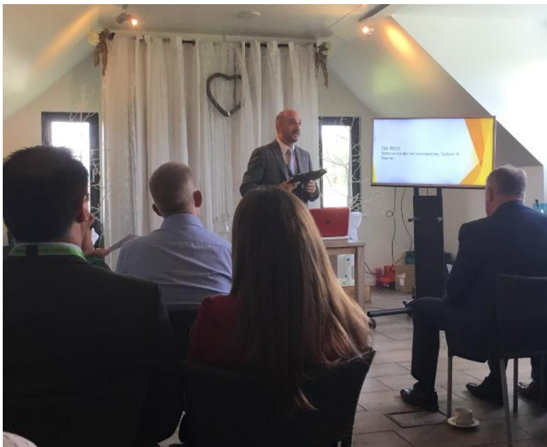
Tourism Partnership Launch

I was delighted to attend the official launch of the Braintree District Tourism Partnership at West Street Vineyard on Thursday 20 th June with a range of public and private tourism stakeholders attending. The Partnership's next meeting will be in September this year once the busy summer period has come to a close.