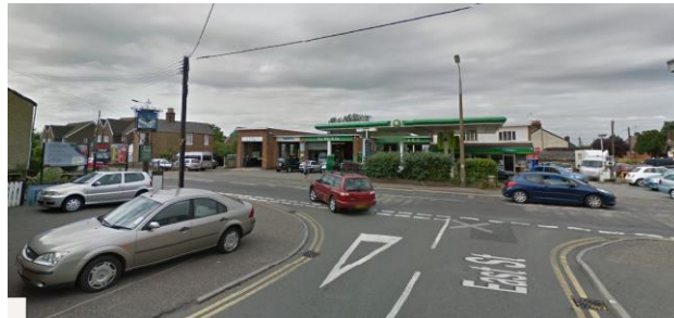
Image 4 – View Looking North/ East on East Street (Pub car park to the left)